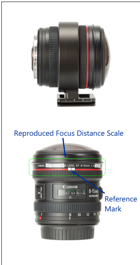
Reproduced Focus Distance Scale